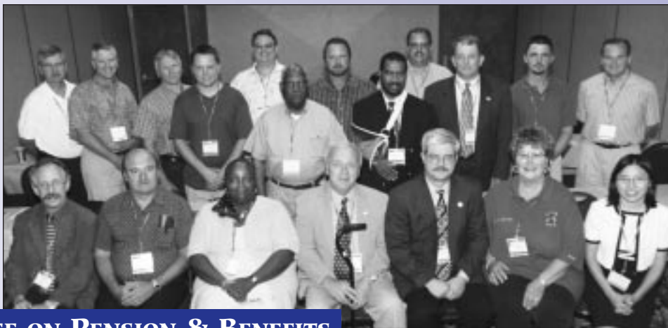
COMMITTEE ON PENSION & BENEFITS