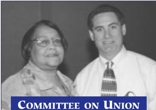
COMMITTEE ON UNION LABEL & EDUCATION (CHAIRMAN & SECY.)