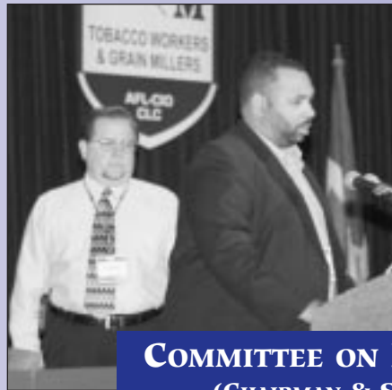
COMMITTEE ON FINANCE (CHAIRMAN & SECY.)