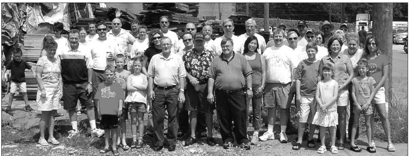
BCTGM Local 25 members gather once every year to celebrate their union contract that ended the 14-week lockout.